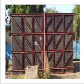
Industrial Square Spiral HDPE Storage