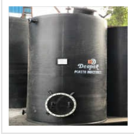
Vertical Spiral HDPE Storage Tank