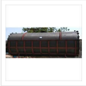
Spiral HDPE Chemical Storage Tank