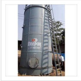
Vertical FRP Storage Tank