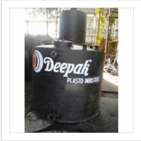
Spiral Storage Tank