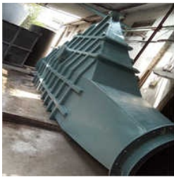
VERTICAL PP AND FRP SOLID TRAP

50 KL Chemical Storage Tank, Aluminum Storage Tank, Black Spiral HDPE Storage Tank, FRP Belt Chemical Blower, FRP Belt Drive Blower, FRP Chemical Stirrer, FRP Industrial Blower, HDPE Acid Storage Tank, HDPE Blower, HDPE Chemical Blower, HDPE Chemical Storage Tank, HDPE Vessel, Industrial Blower, Industrial FRP Storage Tank, Industrial PP / FRP Reactor, etc.