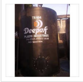
Black Spiral HDPE Storage Tank