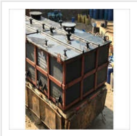
Industrial Spiral HDPE Rectangular Storage