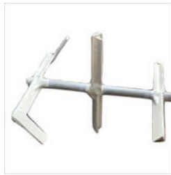
FRP CHEMICAL STIRRER