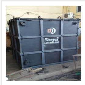
Spiral HDPE Rectangular Tank