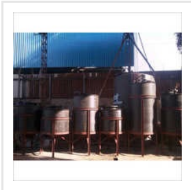
Industrial Spiral HDPE Holding Tank