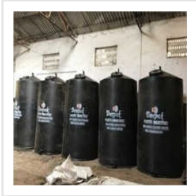
Industrial Spiral HDPE Vertical Storage Tank