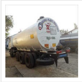
Spiral HDPE Lined Transportation Tanker