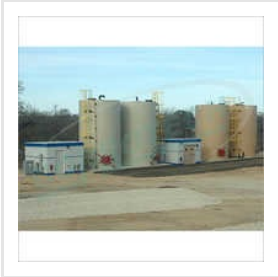
HDPE Acid Storage Tank