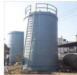
INDUSTRIAL FRP STORAGE TANK