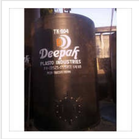
50 KL Chemical Storage Tank