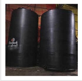
HDPE Chemical Storage Tank